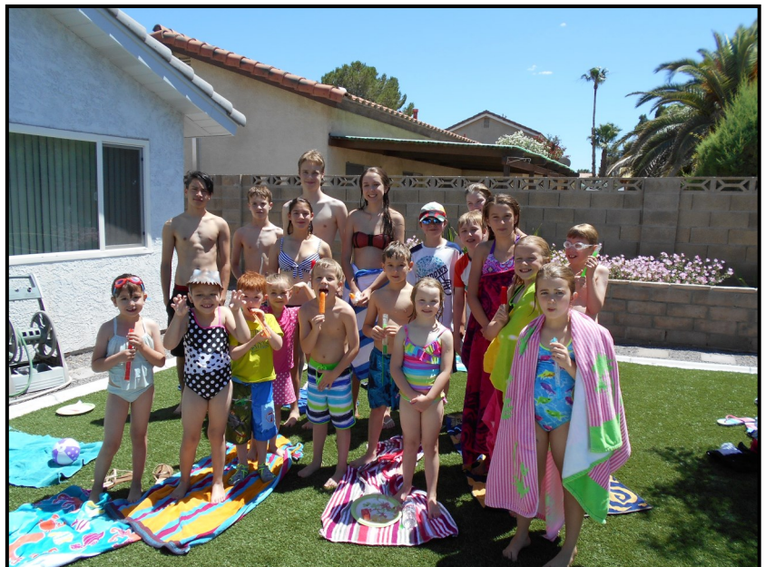
Church School Pool Party