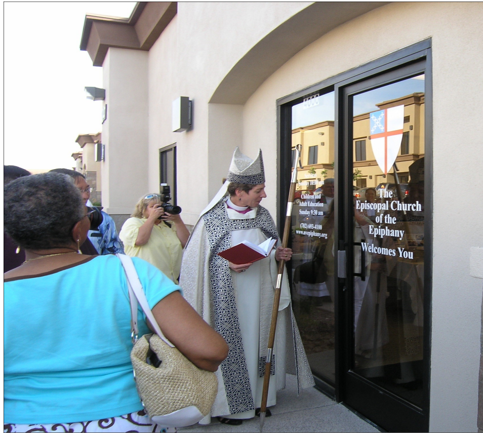
Dedication of our Pecos Location in June 2006

The years that followed brought growth and the enthusiastic development of ministries and traditional events, including a multiple-classroom Church school, a Holy Week program, a Shrove Tuesday Pancake Supper (complete with Pancake races), and a child-centered Christmas Eve Pageant. These activities and others embody Epiphany's family and relationship focus. More and more groups formed that were spiritual and social, such as Greet and Eat dinner groups, book club, bible study, and others. Over the years, our music program has grown and changed, at times embracing various combinations of a youth choir, multiple instrumentalists, vocal soloists, pianists, and a choir.