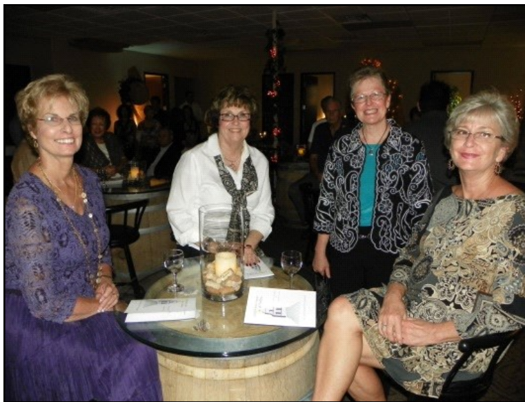
Annual Wine Tasting Fundraiser

Since our beginning, parishioners have purchased some of our basic church and altar needs. With an eye on the future, we recently offered Legacy Planning - planned giving opportunity workshops - and are looking for other ways to maximize our limited financial resources like receiving tax free appreciated stock and IRA rollovers.