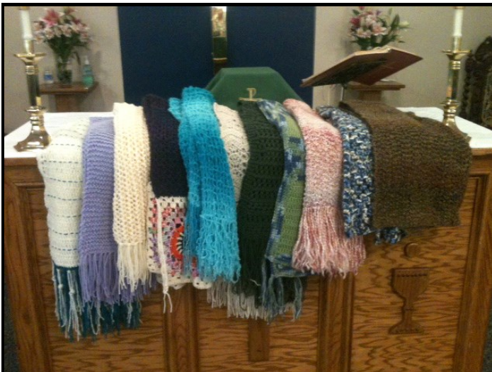
Prayer Shawls being blessed on the altar

“Last year when my mother passed away and my sister was diagnosed with cancer, I was overwhelmed by the special prayers and support of the Prayer Shawl group.” – Age 63