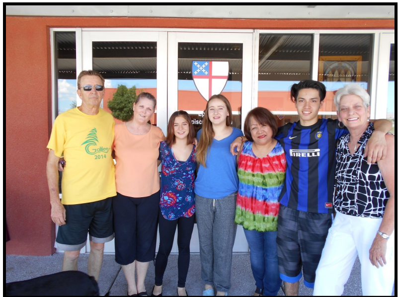
EYO Mission Trip

“It’s not all about the snacks. I feel good about raising money for Haiti because they lost everything.” – Age 8