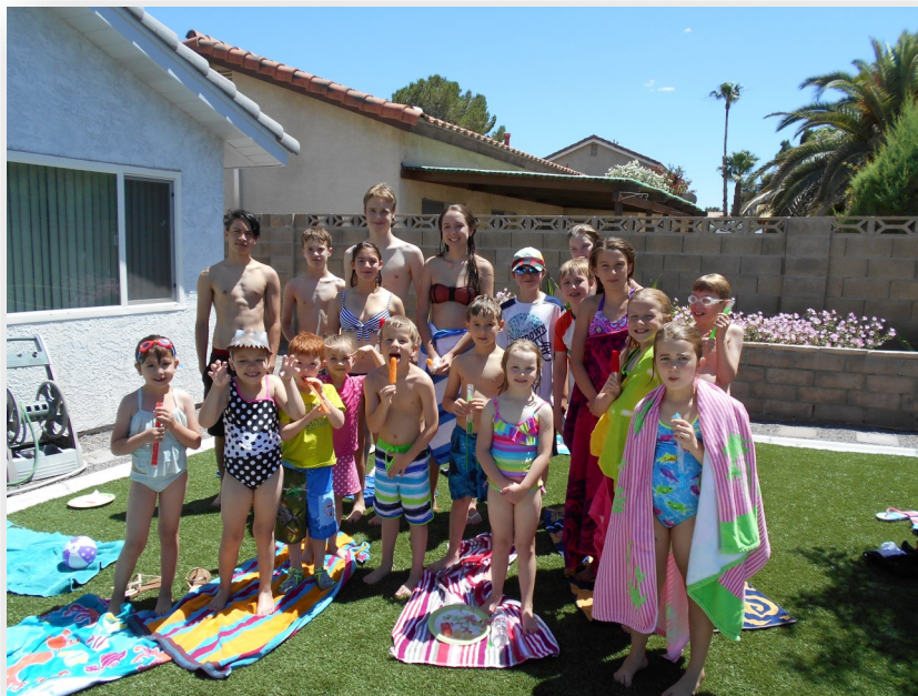
Church School Pool Party