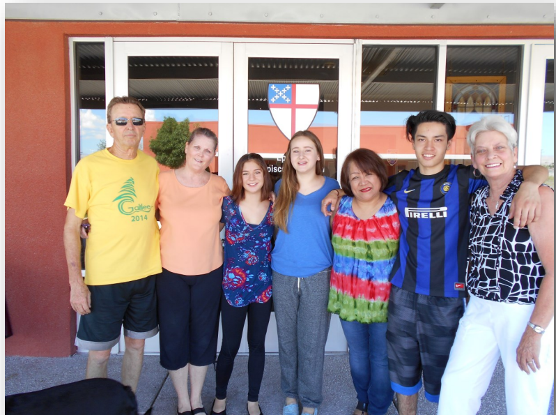
EYO Mission Trip

"It's not all about the snacks. I feel good about raising money for Haiti because they lost everything." – Age 8