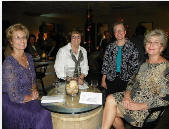
Annual Wine Tasting Fundraiser

Since our beginning, parishioners have purchased some of our basic church and altar needs. With an eye on the future, we recently offered Legacy Planning - planned giving opportunity workshops - and are looking for other ways to maximize our limited financial resources like receiving tax free appreciated stock and IRA rollovers.