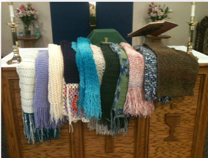
Prayer Shawls being blessed on the altar

"Last year when my mother passed away and my sister was diagnosed with cancer, I was overwhelmed by the special prayers and support of the Prayer Shawl group." – Age 63