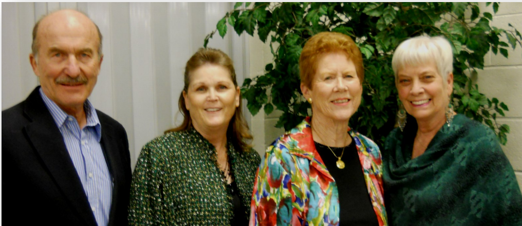
Diocesan Convention Delegates

"The most important feature is the willingness of the people to dedicate and manage the success of the parish." - Age 45