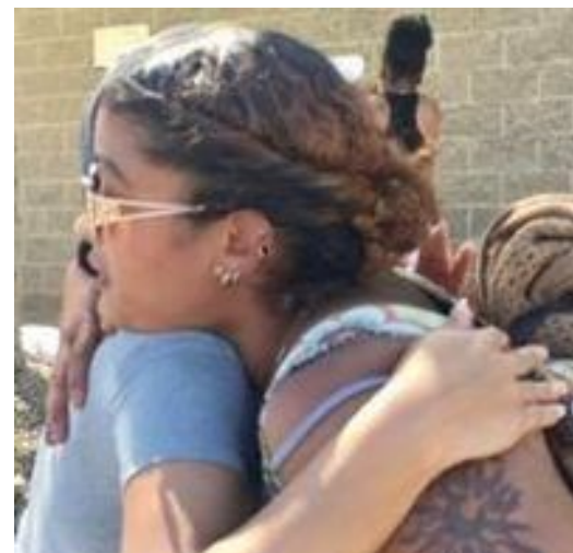
Volunteer gets a grateful hug from a homeless teen who didn't want to provide her name or information. We put her in touch with a youth shelter. Praying she makes her way back to her family.